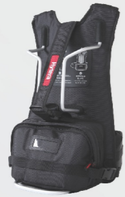
Nylon Backpack (for portable repeater only)(black) NCN010