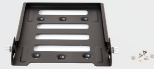
Multi-Functional Installation Bracket BRK17