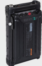
Power Management System PV3001