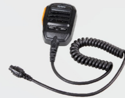
Waterproof Remote Speaker Microphone ( IP67 ) SM18A1

Optional antenna designed by Hytera is highly recommended. *Outdoor use of RD96X with antenna should avoid thunderstorms.