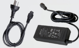
Power Adapter for Portable Repeater PS7502