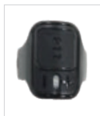
Wireless Finger PTT