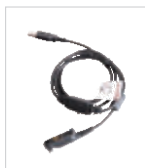
Programming Cable (USB Port) PC45