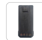
Battery 2000mAh BL2021