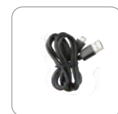
Data cable PC143