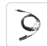
Programming cable PC155