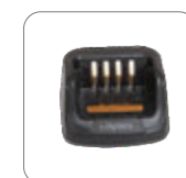
MUC Rapid-rate Charger