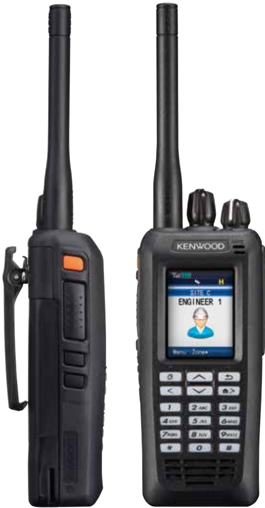
TK-D200(G)/D300(G) Display model