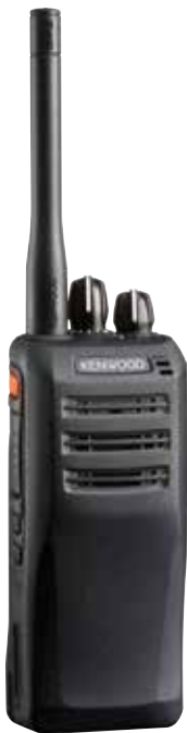
TK-D200(G)/D300(G) Non-keypad, non-Display model