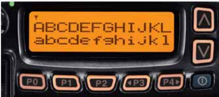
Two line setting display example.

With a high contrast dot matrix display, upper and lower case characters can be easily distinguished. You can change the display setting to show one line and 12 characters, or two lines and 24 characters via programming. LCD backlighting is standard.