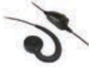
KHS-34 C-Ring In-line PTT Headset (Single Pin Jack)