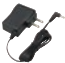
KSC-44SL* AC Adapter Single