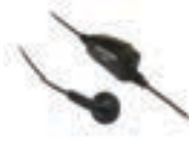
KHS-33 Earbud In-line PTT Headset (Single Pin Jack)